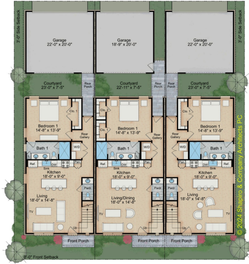
1 First Floor Plan - Townhome B