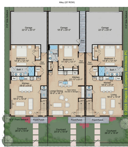
1 First Floor Plan - Townhome A