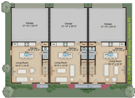
1 First Floor Plan - Townhome C