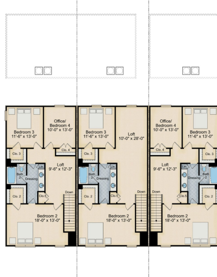
2 Second Floor Plan - Townhome B