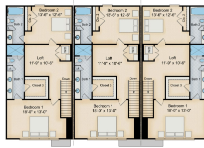
3 Second Floor Plan - Townhome C