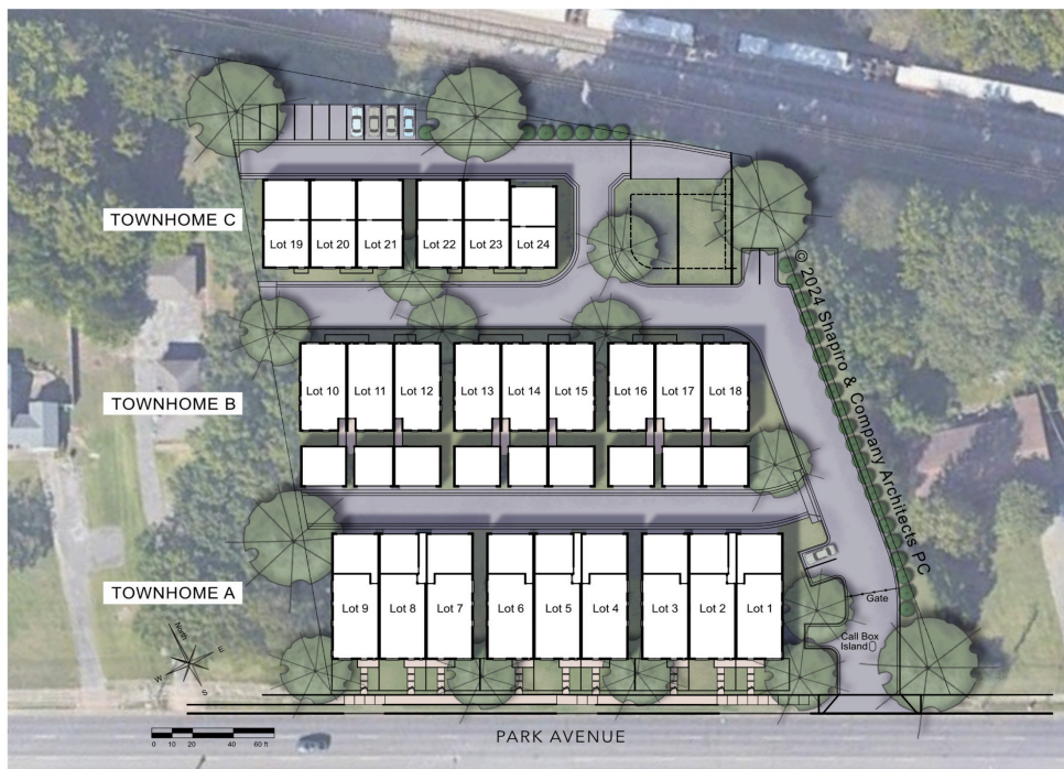
East End Village Site Plan Memphis, TN

Shapiro & Company Architects, PC 901.685.9001 | www.shapiroandco.com