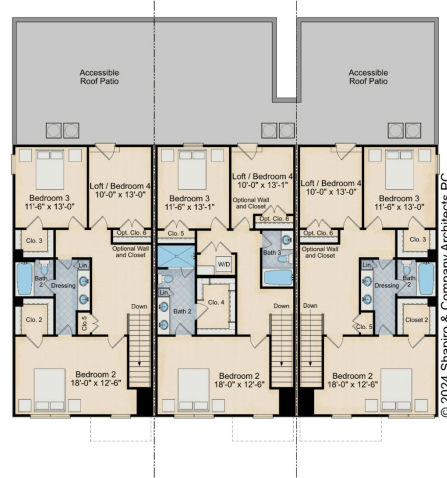
2 Second Floor Plan - Townhome A