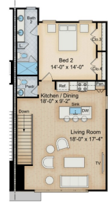
4 Partial Second Floor Plan Townhome C Lot 24 Only